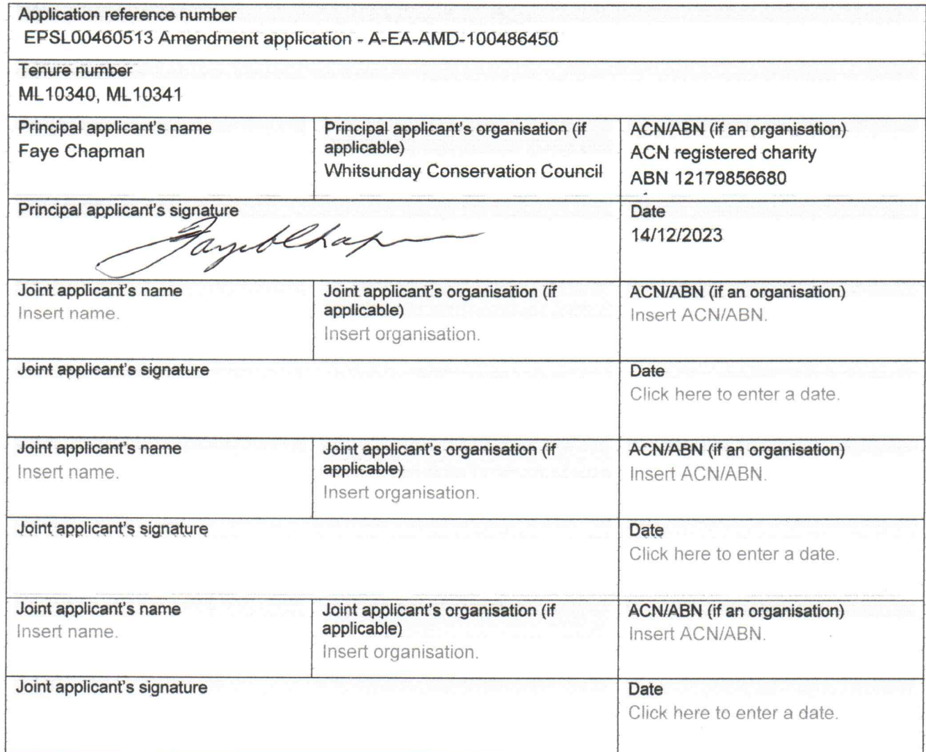
Table 2: Details of the application or amendment application

Where there were joint applicants for the application or amendment application, each applicant must sign this notice. If there is insufficient space to sign, please print this page in multiple and attach to the submitted notice.